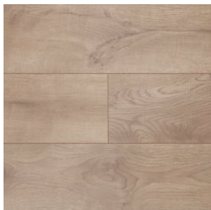
ID4958 DUB MESSEDZH