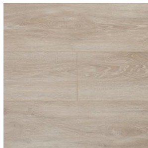
ID4960 DUB SEDNESS