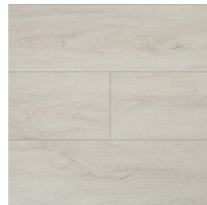
ID4961 DUB GREVITI