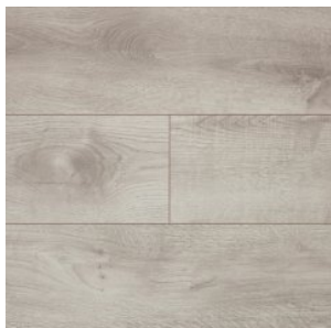
ID4957 DUB SHEDOU