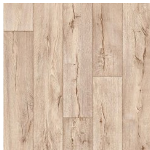
CRACKED OAK 1

Width: 5 M The dimension of the design: 20 x 150 cm