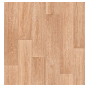
PURE OAK 1

Width: 5 M The dimension of the design: 20 x 150 cm