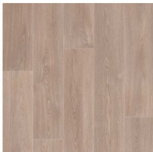
COLUMBIAN OAK 1

Width: 5 M The dimension of the design: 20 x 150 cm