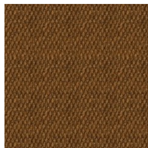
HONG KONG 7006