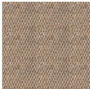
HONG KONG 1153