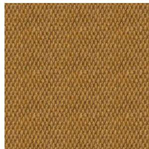
HONG KONG 1199