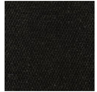
HONG KONG 2343