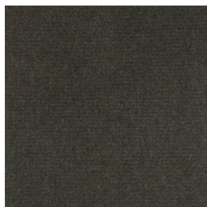
HONG KONG 6265