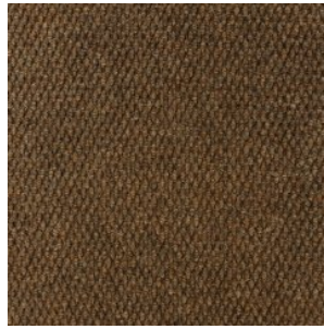
HONG KONG 1244