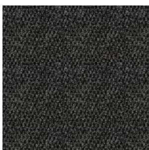
HONG KONG 2098