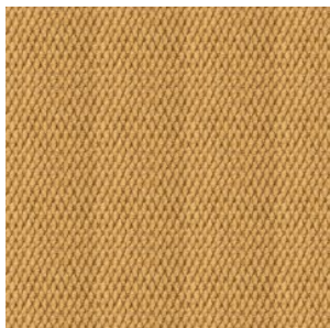
HONG KONG 1099