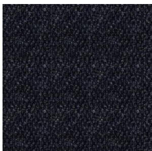
HONG KONG 5154