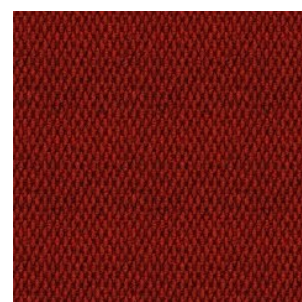
HONG KONG 3353