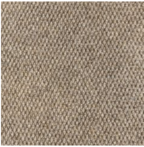
HONG KONG 1153