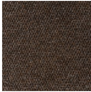
HONG KONG 7097