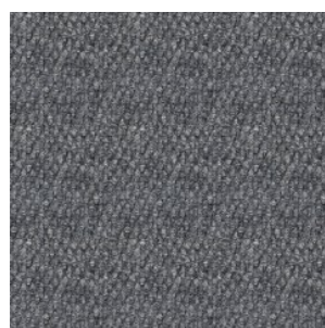
HONG KONG 2531