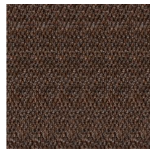
HONG KONG 7097