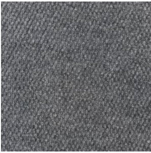
HONG KONG 2531