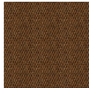
HONG KONG 1244