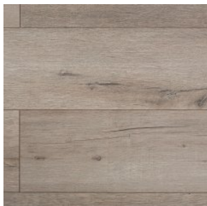
ID6177 DUB INVIZIBL