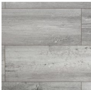
ID6176 DUB KONFESHN