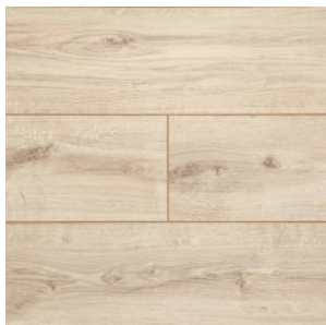
JT102 Dub Adriatika