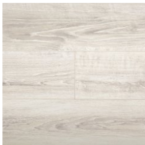
JT103 YAsen Balkanskiy