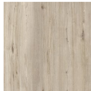
JT107 Dub Piranskiy

Images of designs may differ from actual product samples due to the color rendition of the printing industry.