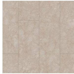
FP742 KVARTSIT RIALTO