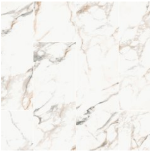
FP740 MRAMOR ESPLANADA