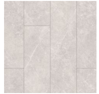
FP743 GRANIT PETRA

Images of designs may differ from actual product samples due to the color rendition of the printing industry.