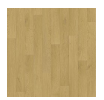
FALCO 22 Width: 2 M The dimension of the design: 10 x 100 cm