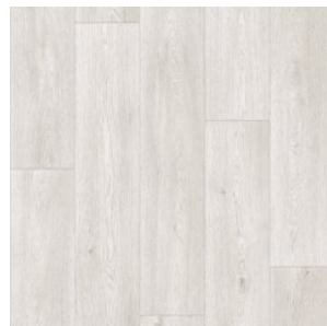
COLUMBIAN OAK 11

Width: 2,5/3/3,5/4 M The dimension of the design: 20 x 150 cm