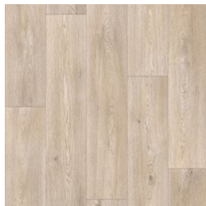
COLUMBIAN OAK 5

Width: 2,5/3/3,5/4 M The dimension of the design: 20 x 150 cm