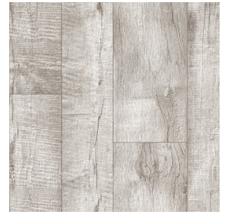
DANISH OAK 1

Width: 2,5/3/3,5/4 M The dimension of the design: 20 x 100 cm