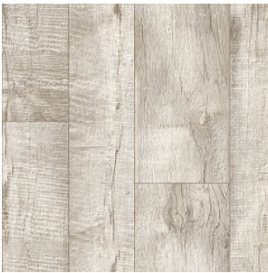
DANISH OAK 2

Width: 2/2,5/3/3,5/4 M The dimension of the design: different width x 100 cm