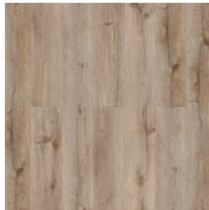
DUB YANTARNYY 1587

Images of designs may differ from actual product samples due to the color rendition of the printing industry.