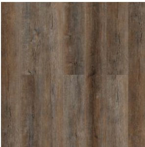
DUB KORNUOLL 1585