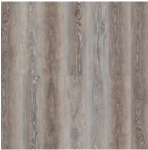
DUB ARDEN 1588