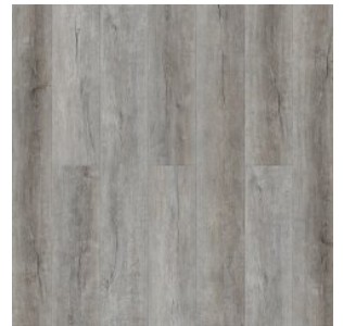
DUB EKTOR 1584