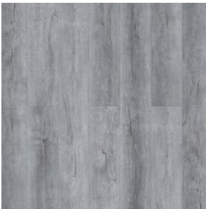
DUB ESKALIBUR 1582