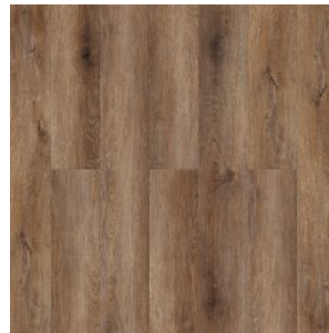
DUB RYTSARSKIY 1589