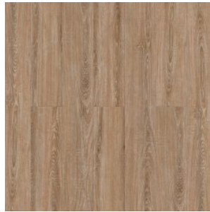
DUB VALLIYSKIY 1586