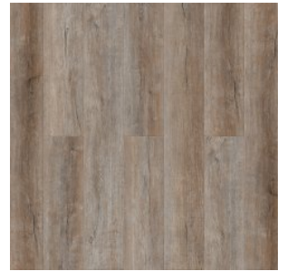
DUB KELTSKIY 1583