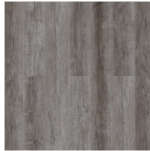
DUB KAMELOT 1581