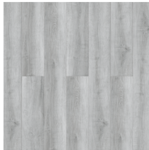
DUB MORGANA 1690