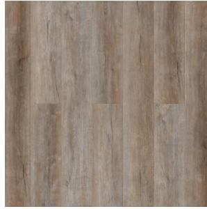
DUB KELTSKIY 1583