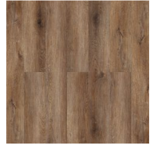
DUB RYTSARSKIY 1589