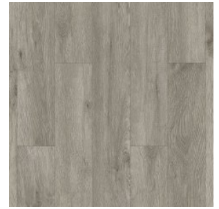
MILD GREY 5116