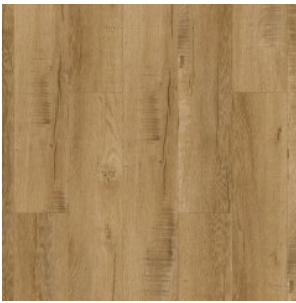
TIMBER WOOD 1331

Images of designs may differ from actual product samples due to the color rendition of the printing industry.