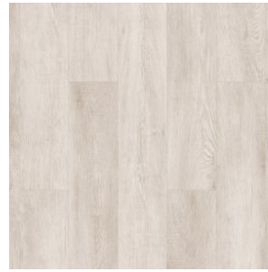
CHILLY WHITE 2851