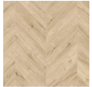
OAK GETTYSBURG 2016