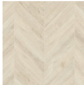
OAK SOMMA 8810