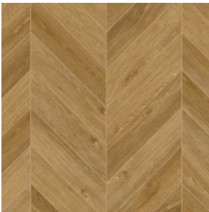
OAK MARENGO 2196