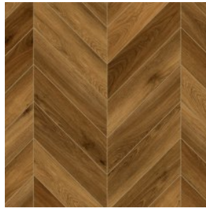
OAK AUSTERLITZ 1600