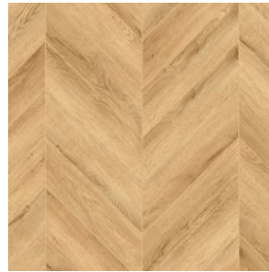
OAK DUNKIRK 8816