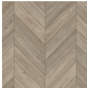
OAK MARNE 2195