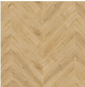
OAK WATERLOO 1010