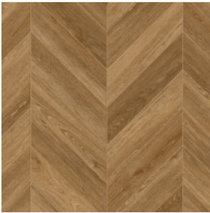
OAK ARDENNES 2197