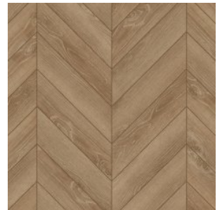
OAK VERDUN 2165