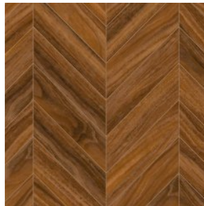
WALNUT AZINCOURT 8112

Images of designs may differ from actual product samples due to the color rendition of the printing industry.