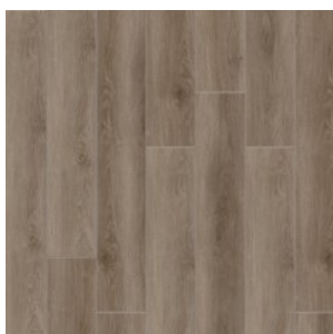
Dub Channel 2008

Images of designs may differ from actual product samples due to the color rendition of the printing industry.