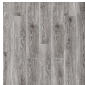
Dub Mokhave 2009