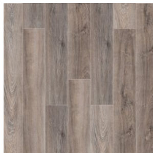
Dub Vayoming 2005