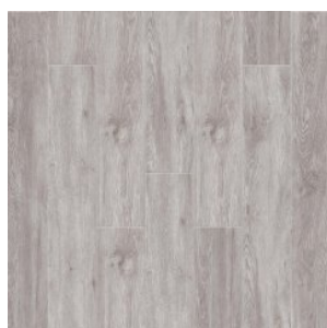
Dub Ogayo 2003