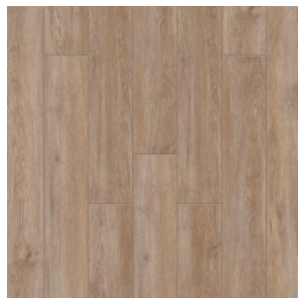
Dub Yellouston 2006