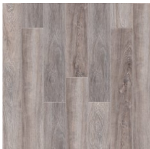
Dub Arizona 2001