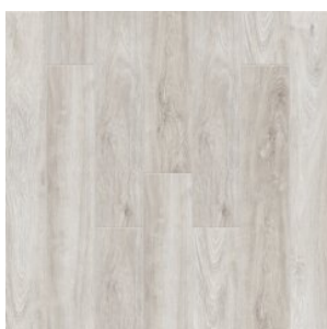
Dub Navakho 2002